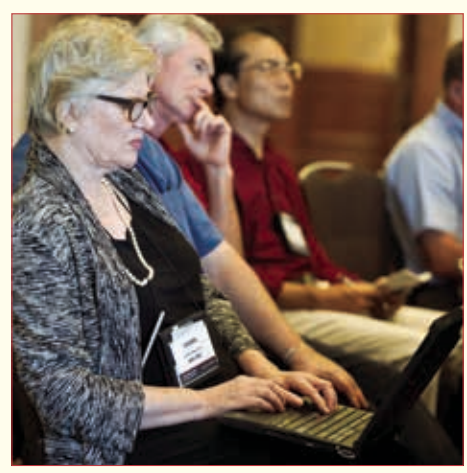
Counsel hard at work on crafting legislative language to best suit the needs of the Member Boards.

The West Virginia Board also reports these orders to the NCEES Enforcement Exchange database, as do most PE licensing boards. The